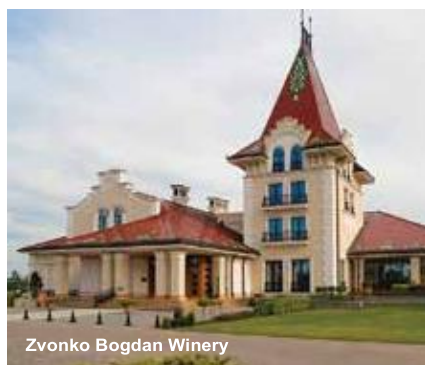
Zvonko Bogdan Winery

Breakfast. Drive to Belgrade. Today you will explore the most interesting sights of Vojvodina, a province in the north of Serbia. After a leisurely drive through the Pannonian Plain, you will reach the pearl of