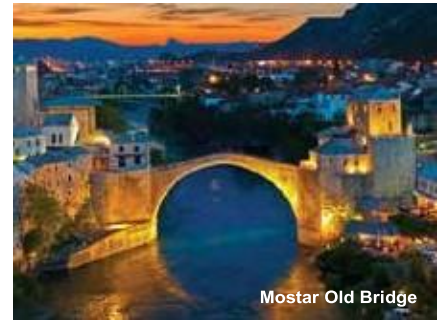
Mostar Old Bridge

medieval times. Walking its charming streets, you will find yourself immersed in the blend of Romanesque, Gothic, Renaissance and Baroque architecture. Look out for the Cathedral of Saint Lawrence, the Clock Tower, the Loggia, the Land Gate, Kamerlengo Castle and Saint Mark's Tower. Return to Split. In the evening, relax in the charming Mediterranean atmosphere and while your free time enjoy dinner in a restaurant by the sea.